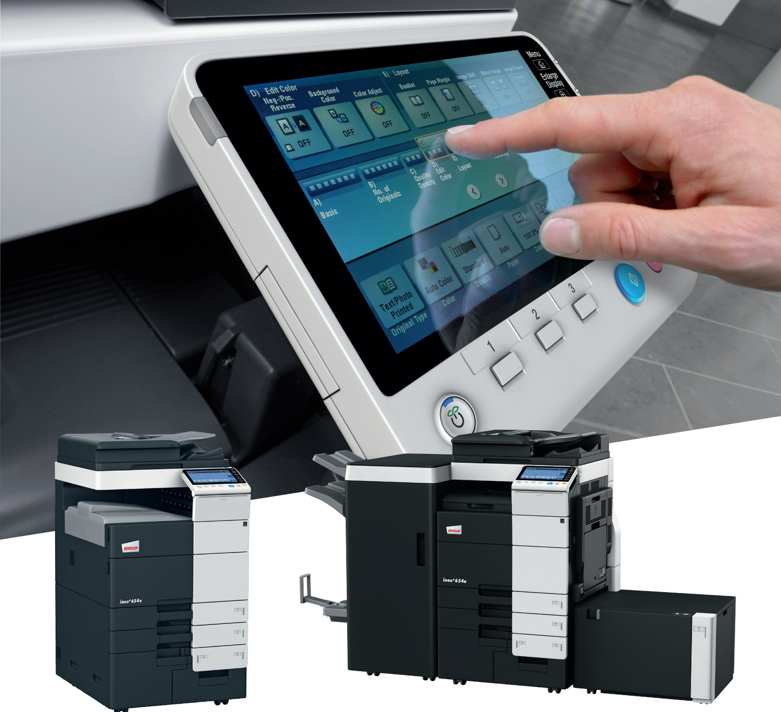
ineo+ 654e with output tray (OT-503)