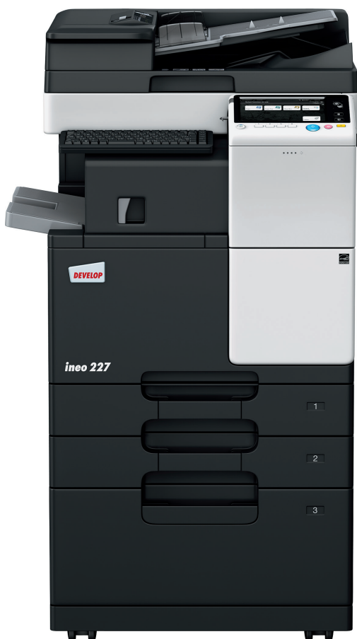
ineo 227 with document feeder (DF-628), inner finisher (FS-533), paper feeder (PC-413) and keyboard holder (KH-102)

Job centres, schools and universities, engineering firms, architect's offices, insurance companies, banks, libraries: many small to mid-sized businesses or organisations don't really need colour printing capabilities. What their users really require is a monochrome multifunctional device that is intuitively easy to use and offers simple mobile usability for the increasing number of mobile office workers.