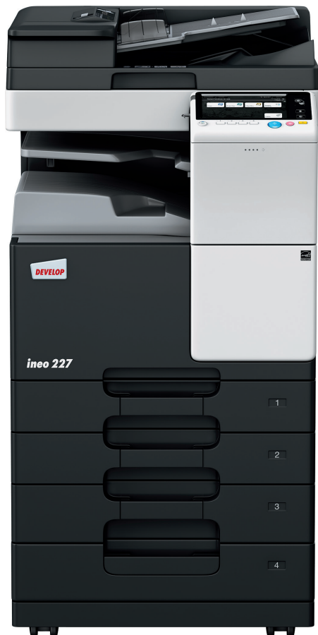
ineo 227 with document feeder (DF-628), job separator (JS-506) and paper feeder (PC-213)