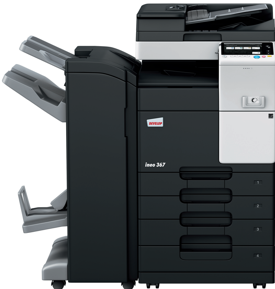
ineo 367 with document feeder (DF-628), staple/booklet finisher (FS-534SD), paper feeder (PC-213) and mount kit for local ID card authentication device (MK-735)

Job centres, schools and universities, engineering firms, architect's offices, insurance companies, banks, libraries: many small to mid-sized businesses or organisations don't really need colour printing capabilities. What their users really require is a monochrome multifunctional device that is intuitively easy to use and offers simple mobile usability for the increasing number of mobile office workers.