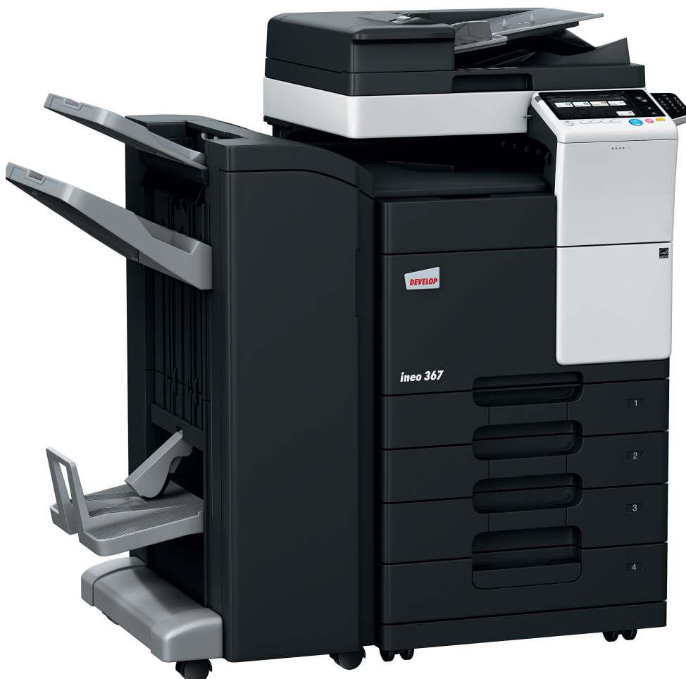
ineo 367 with document feeder (DF-628), staple/booklet finisher (FS-534SD), paper feeder (PC-213) and 10-key pad (KP-101)

The monochrome devices features a variety of energy-saving functions that cut power consumption. Besides saving you money, these green features are also good for the environment – and your carbon footprint.